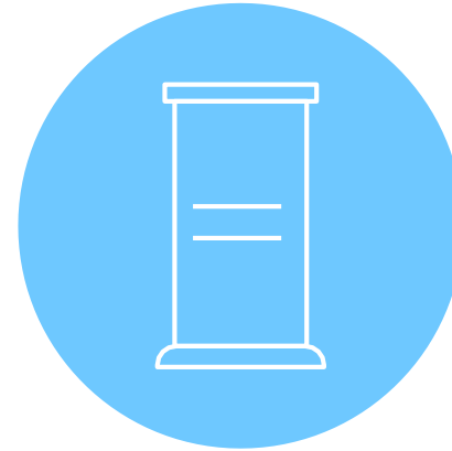
SPACE FOR 1-2 ROLL-UPS (provided by the exhibitor)