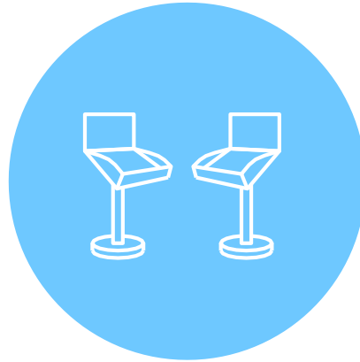
2 HIGH CHAIRS